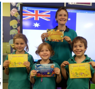
Week 4 award winners. Great work!